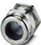
Metal screw connection up to 5 bar, thread length: 6 mm, cable diameter: 11 - 16 mm, WAF 27, screw connection: M20

Cable gland - HC-M-KV-M20(11-16) - 1645998