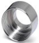
Step-up adapter, M20 to M25, including O-ring

Extension adapter - ENLAR-M-KV-M20/M25 - 1647666