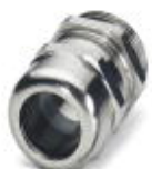
Cable gland, cable gland material: Nickel-plated brass, external cable diameter 6 mm ... 12 mm, shielding: no, connecting thread: M20 x 1.5, color: silver, with O-ring

Cable gland - G-INS-M20-S68N-NNES-S - 1411163