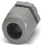
Cable gland, cable gland material: PA, external cable diameter 6 mm ... 12 mm, shielding: no, connecting thread: M20 x 1.5, color: silver-gray RAL 7001

Cable gland - G-INS-M20-S68N-PNES-GY - 1411125