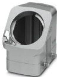
HEAVYCON EVO sleeve housing, EMC version, without powder coating, with bayonet flange for EVO screw connection, B10, for double locking latch, height: 64 mm, without EVO screw connection.

Please be informed that the data shown in this PDF Document is generated from our Online Catalog. Please find the complete data in the user's documentation. Our General Terms of Use for Downloads are valid ( http://phoenixcontact.com/download )