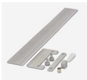
DIN rail, for larger distance between coil and transformer terminal, aluminum, 2 x 35 mm, length: 1 m

Please be informed that the data shown in this PDF Document is generated from our Online Catalog. Please find the complete data in the user's documentation. Our General Terms of Use for Downloads are valid ( http://phoenixcontact.com/download )