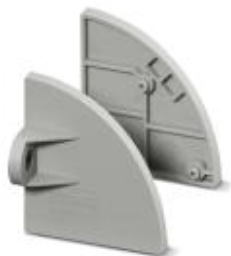
Flange, number of positions: 0, color: gray

Please be informed that the data shown in this PDF Document is generated from our Online Catalog. Please find the complete data in the user's documentation. Our General Terms of Use for Downloads are valid ( http://phoenixcontact.com/download )