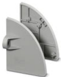
Flange, number of positions: 0, color: gray

Please be informed that the data shown in this PDF Document is generated from our Online Catalog. Please find the complete data in the user's documentation. Our General Terms of Use for Downloads are valid ( http://phoenixcontact.com/download )