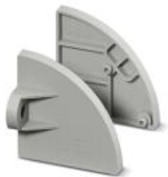
Flange, number of positions: 0, color: gray

Please be informed that the data shown in this PDF Document is generated from our Online Catalog. Please find the complete data in the user's documentation. Our General Terms of Use for Downloads are valid ( http://phoenixcontact.com/download )