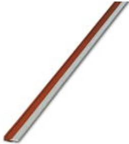
Jumper for PCO power connector in ME-MAX housing, color: red (similar to RAL 3000)

Please be informed that the data shown in this PDF Document is generated from our Online Catalog. Please find the complete data in the user's documentation. Our General Terms of Use for Downloads are valid ( http://phoenixcontact.com/download )