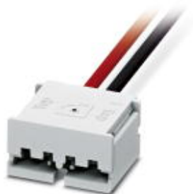
Assembled PCB connectors

Please be informed that the data shown in this PDF Document is generated from our Online Catalog. Please find the complete data in the user's documentation. Our General Terms of Use for Downloads are valid ( http://phoenixcontact.com/download )