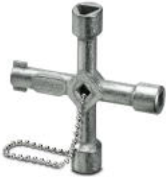
Control cabinet key, metal, for all common types of control cabinet

Please be informed that the data shown in this PDF Document is generated from our Online Catalog. Please find the complete data in the user's documentation. Our General Terms of Use for Downloads are valid ( http://phoenixcontact.com/download )