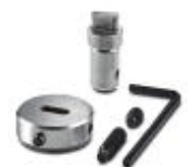
Stamping bit, for elongated holes: 4.5 x 12 mm

Stamping bit - PPS-ST (4,5X12)L - 1203534