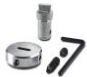
Stamping bit, for elongated holes: 3.5 x 12 mm

Stamping bit - PPS-ST (3,5X12)L - 1203563