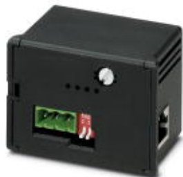
Gateway RS-485/Ethernet communication module for the EEM-MA600 with integrated web server

Please be informed that the data shown in this PDF Document is generated from our Online Catalog. Please find the complete data in the user's documentation. Our General Terms of Use for Downloads are valid ( http://phoenixcontact.com/download )