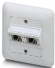
Terminal outlet, flush-type mounting, IP20, two slots for contact inserts with the Freenet system

Please be informed that the data shown in this PDF Document is generated from our Online Catalog. Please find the complete data in the user's documentation. Our General Terms of Use for Downloads are valid ( http://phoenixcontact.com/download )