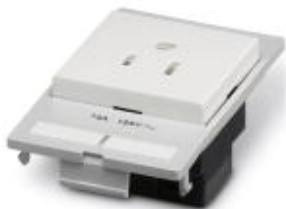
Ground contact socket, plastic, for USA

Please be informed that the data shown in this PDF Document is generated from our Online Catalog. Please find the complete data in the user's documentation. Our General Terms of Use for Downloads are valid ( http://phoenixcontact.com/download )