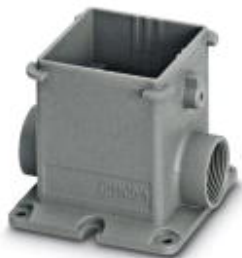
DUPLICON, aluminum T-box, type B6, IP67 protection, 2 x M25 cable screw connection thread (without cable screw connection)

Please be informed that the data shown in this PDF Document is generated from our Online Catalog. Please find the complete data in the user's documentation. Our General Terms of Use for Downloads are valid ( http://phoenixcontact.com/download )