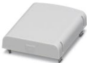
Cover, short design, color: light gray

Please be informed that the data shown in this PDF Document is generated from our Online Catalog. Please find the complete data in the user's documentation. Our General Terms of Use for Downloads are valid ( http://phoenixcontact.com/download )