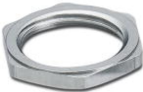
M20 x 1.5 locking nut

Please be informed that the data shown in this PDF Document is generated from our Online Catalog. Please find the complete data in the user's documentation. Our General Terms of Use for Downloads are valid ( http://phoenixcontact.com/download )