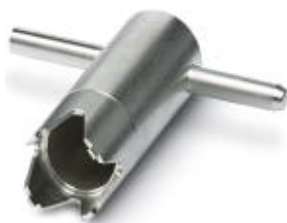
Special pipe wrench, tool for mounting the M23 cable connector housing for assembly

Please be informed that the data shown in this PDF Document is generated from our Online Catalog. Please find the complete data in the user's documentation. Our General Terms of Use for Downloads are valid ( http://phoenixcontact.com/download )