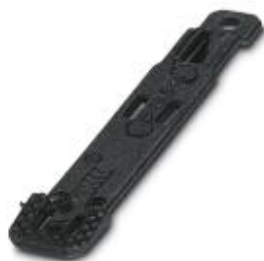
Carrier for conductor marking collar, black, unlabeled, mounting type: Assembly with cable binders, cable diameter: > 16 mm, lettering field size: 70 x 10 mm

Please be informed that the data shown in this PDF Document is generated from our Online Catalog. Please find the complete data in the user's documentation. Our General Terms of Use for Downloads are valid ( http://phoenixcontact.com/download )