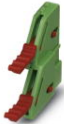
Ejectors, for assembly on each side of the header

Please be informed that the data shown in this PDF Document is generated from our Online Catalog. Please find the complete data in the user's documentation. Our General Terms of Use for Downloads are valid ( http://phoenixcontact.com/download )