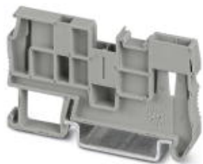
Self-locking flange, width: 5.2 mm, height: 35.3 mm, color: gray, mounting type: NS 35/7,5, NS 35/15

Please be informed that the data shown in this PDF Document is generated from our Online Catalog. Please find the complete data in the user's documentation. Our General Terms of Use for Downloads are valid ( http://phoenixcontact.com/download )