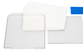
Advanced 3D printing kit Add a front enclosure, extra build plate and adhesion sheets