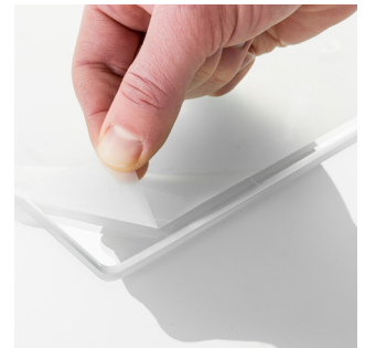
Adhesion sheets x25 For effective build plate adhesion