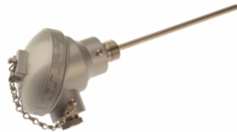
(with process connection – 1/2"BSPP parallel)