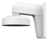
DS-1272ZJ-110-TRS Wall Mounting Bracket