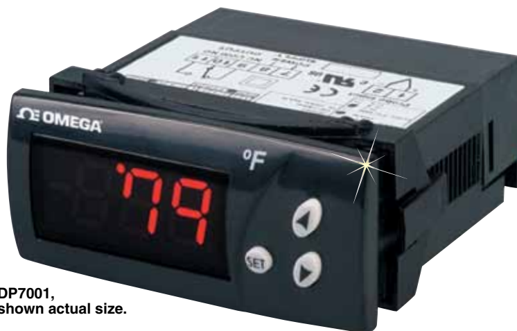
DP7001, shown actual size.

Power Requirement: 115 Vac, 230 Vac, 12 Vac/Vdc or 24 Vac/Vdc (depending on model)