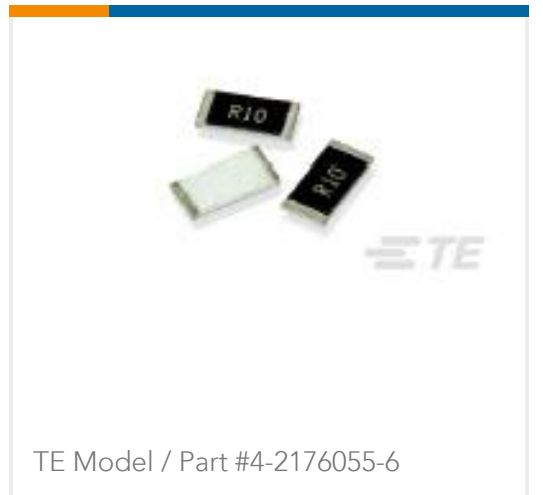
RLP73K 2B R75 1% 1K RL