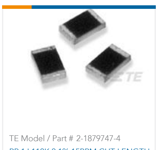
RP 1J 110K 0.1% 15PPM CUT LENGTH