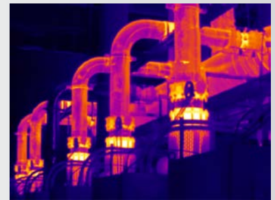
MultiSharp Focus, available on the Ti450 PRO and Ti480 PRO