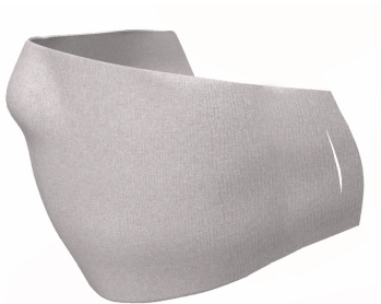
Picture 01. 3D of the Soft Mask