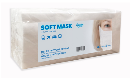
Picture 03. Pack of 40 soft masks