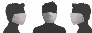
Picture 04. Position of de mask on person