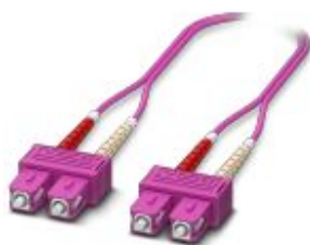
Multi-mode OM4 duplex jumper, SC-SC, UPC polishing, length 5 m

Please be informed that the data shown in this PDF Document is generated from our Online Catalog. Please find the complete data in the user's documentation. Our General Terms of Use for Downloads are valid ( http://phoenixcontact.com/download )