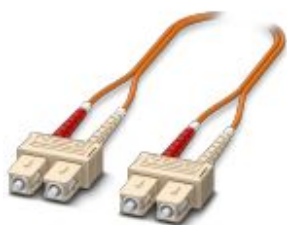
Multi-mode OM2 duplex jumper, SC-SC, UPC polishing, length 2 m

Please be informed that the data shown in this PDF Document is generated from our Online Catalog. Please find the complete data in the user's documentation. Our General Terms of Use for Downloads are valid ( http://phoenixcontact.com/download )