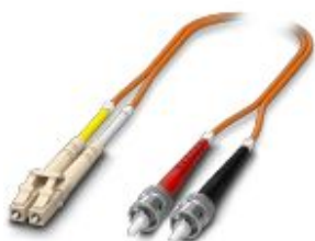
Multi-mode OM2 duplex jumper, LC-ST, UPC polishing, length 2 m

Please be informed that the data shown in this PDF Document is generated from our Online Catalog. Please find the complete data in the user's documentation. Our General Terms of Use for Downloads are valid ( http://phoenixcontact.com/download )