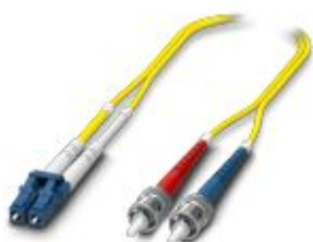
Single-mode OS2 duplex jumper, LC-ST, UPC polishing, length 2 m

Please be informed that the data shown in this PDF Document is generated from our Online Catalog. Please find the complete data in the user's documentation. Our General Terms of Use for Downloads are valid ( http://phoenixcontact.com/download )