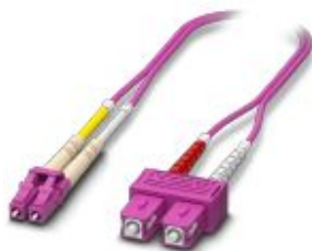
Multi-mode OM4 duplex jumper, LC-SC, UPC polishing, length 3 m

Please be informed that the data shown in this PDF Document is generated from our Online Catalog. Please find the complete data in the user's documentation. Our General Terms of Use for Downloads are valid ( http://phoenixcontact.com/download )