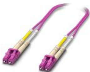
Multi-mode OM4 duplex jumper, LC-LC, UPC polishing, length 2 m

Please be informed that the data shown in this PDF Document is generated from our Online Catalog. Please find the complete data in the user's documentation. Our General Terms of Use for Downloads are valid ( http://phoenixcontact.com/download )