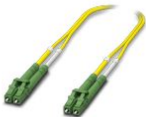
Single-mode OS2 duplex jumper, LC-LC, APC polishing, length 2 m

Please be informed that the data shown in this PDF Document is generated from our Online Catalog. Please find the complete data in the user's documentation. Our General Terms of Use for Downloads are valid ( http://phoenixcontact.com/download )