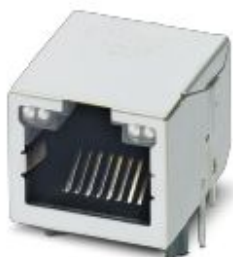
RJ45 socket insert, type: RJ45, degree of protection: IP20, number of positions: 8, 10 Gbps, connection method: Solder connection

Please be informed that the data shown in this PDF Document is generated from our Online Catalog. Please find the complete data in the user's documentation. Our General Terms of Use for Downloads are valid ( http://phoenixcontact.com/download )