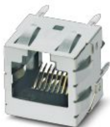
RJ45 socket insert, type: RJ45, degree of protection: IP20, number of positions: 8, 10 Gbps, connection method: Solder connection

Please be informed that the data shown in this PDF Document is generated from our Online Catalog. Please find the complete data in the user's documentation. Our General Terms of Use for Downloads are valid ( http://phoenixcontact.com/download )