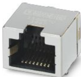
RJ45 socket insert, degree of protection: IP20, 10 Gbps, connection method: Solder connection

Please be informed that the data shown in this PDF Document is generated from our Online Catalog. Please find the complete data in the user's documentation. Our General Terms of Use for Downloads are valid ( http://phoenixcontact.com/download )