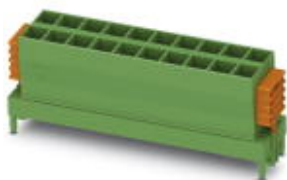
The figure shows a 10-pos. version with 20 contacts

PCB direct plug, nominal current: 12 A, rated voltage (III/2): 320 V, nominal cross section: 2.5 mm 2 , number of positions: 14, pitch: 5 mm, connection method: Crimp connection, color: green, contact surface: Tin, mounting: SKEDD - Direct plug-in technology