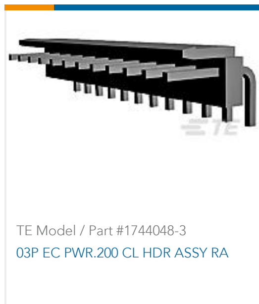
TE Model / Part #1744048-3 03P EC PWR.200 CL HDR ASSY RA