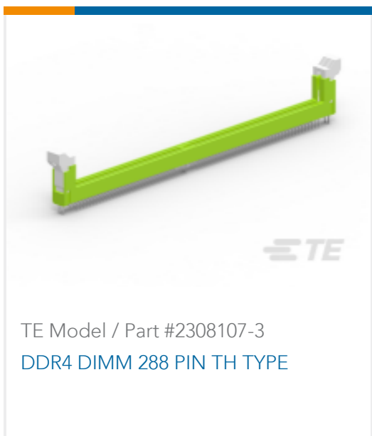
TE Model / Part #2308107-3 DDR4 DIMM 288 PIN TH TYPE