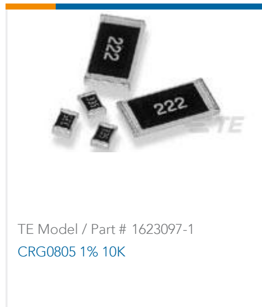
TE Model / Part # 1623097-1 CRG0805 1% 10K