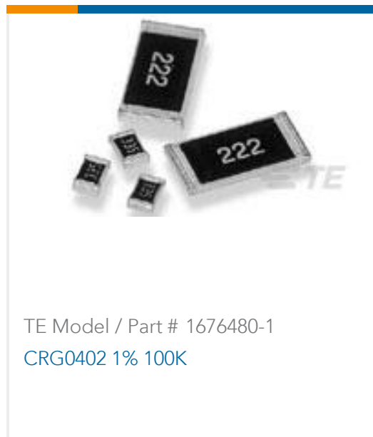
TE Model / Part # 1676480-1 CRG0402 1% 100K