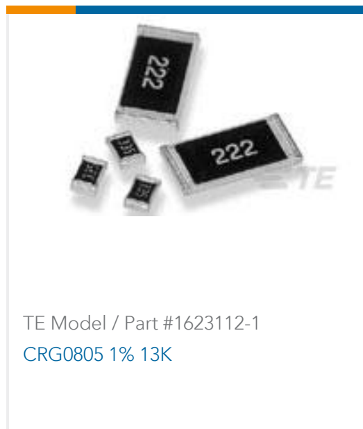
TE Model / Part #1623112-1 CRG0805 1% 13K