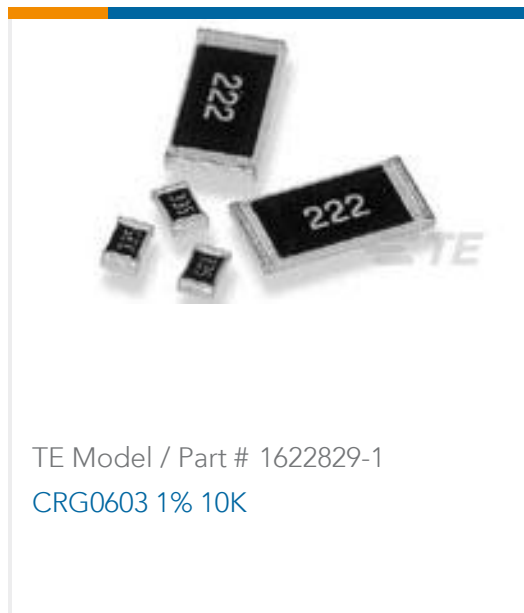
TE Model / Part # 1622829-1 CRG0603 1% 10K