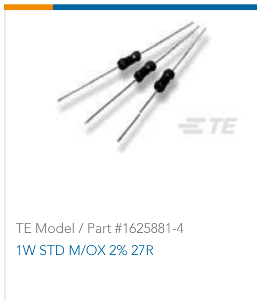
TE Model / Part #1625881-4 1W STD M/OX 2% 27R