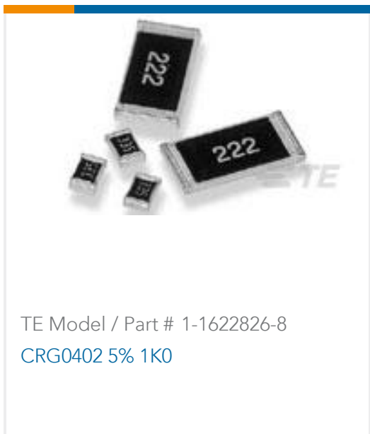
TE Model / Part # 1-1622826-8 CRG0402 5% 1K0