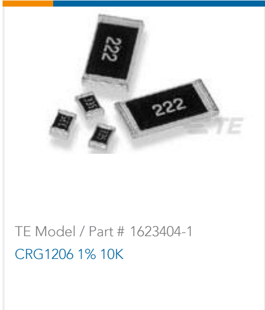
TE Model / Part # 1623404-1 CRG1206 1% 10K