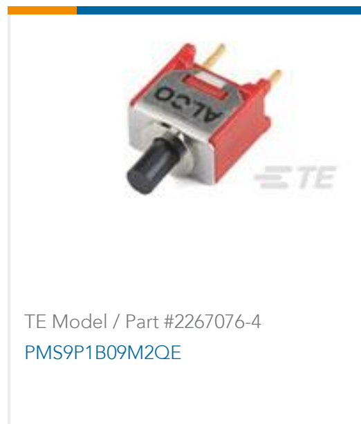
TE Model / Part #2267076-4 PMS9P1B09M2QE