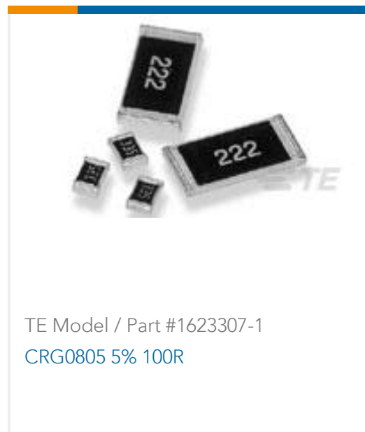
TE Model / Part #1623307-1 CRG0805 5% 100R