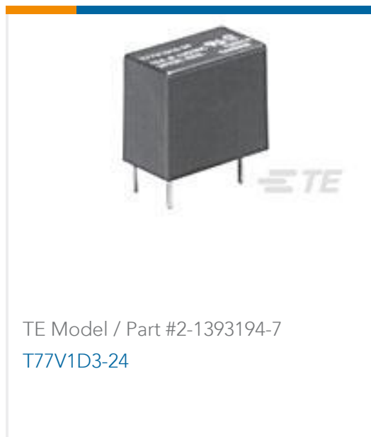
TE Model / Part #2-1393194-7 T77V1D3-24