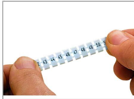
Stretching a WMB marker strip.