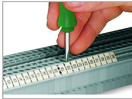
Snapping a marking strip into the marker slot.