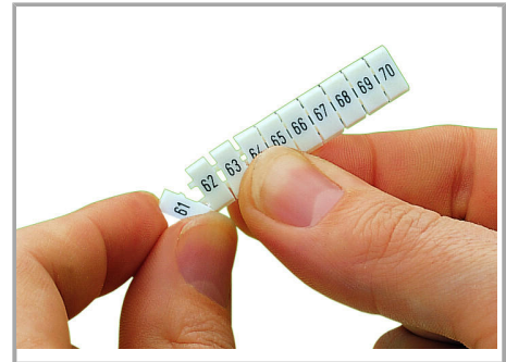
Separating an individual marker from the WMB marker strip – for larger terminal blocks.

Subject to changes. Please also observe the further product documentation!