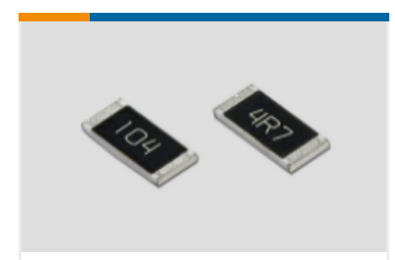
Surface Mount Resistors(647)