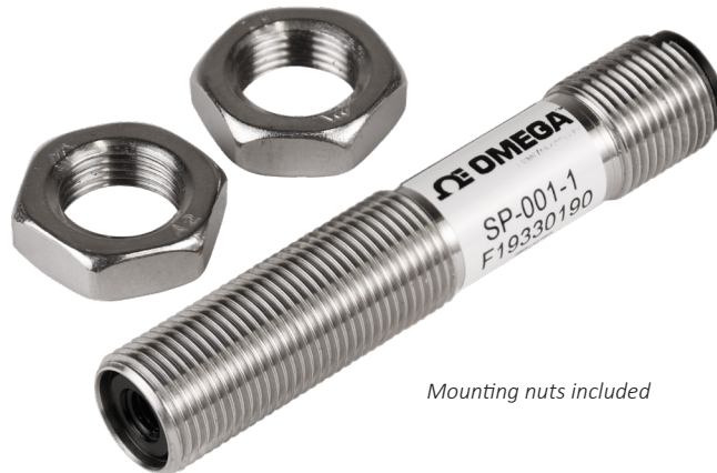
Mounting nuts included

The Omega Smart IR Temperature Probe is a miniature infrared sensor that measures the surface temperature of a solid or liquid without contact. It can measure non-metal surfaces between -70 to 380°C (-94 to 716°F). It also features a built-in sensor to measure the ambient temperature of the probe itself.