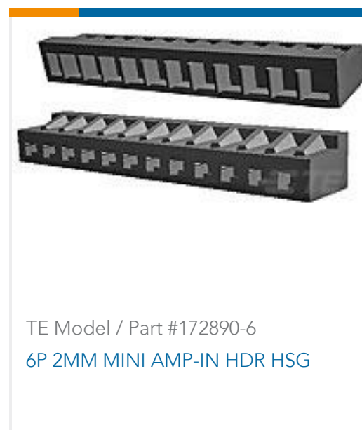
TE Model / Part #172890-6 6P 2MM MINI AMP-IN HDR HSG