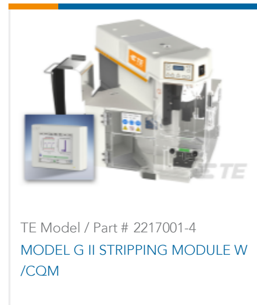
TE Model / Part # 2217001-4 MODEL G II STRIPPING MODULE W /CQM