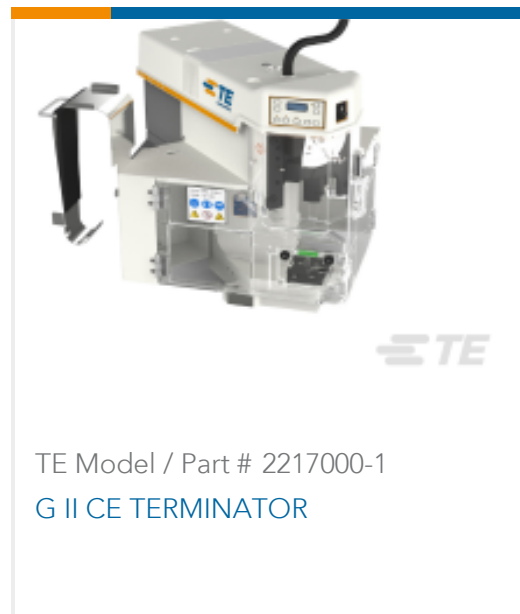
TE Model / Part # 2217000-1 G II CE TERMINATOR