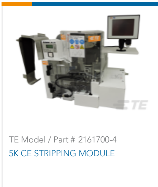
TE Model / Part # 2161700-4 SK CE STRIPPING MODULE