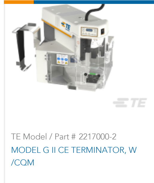
TE Model / Part # 2217000-2 MODEL G II CE TERMINATOR, W /CQM