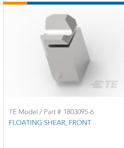
TE Model / Part # 1803095-6 FLOATING SHEAR, FRONT