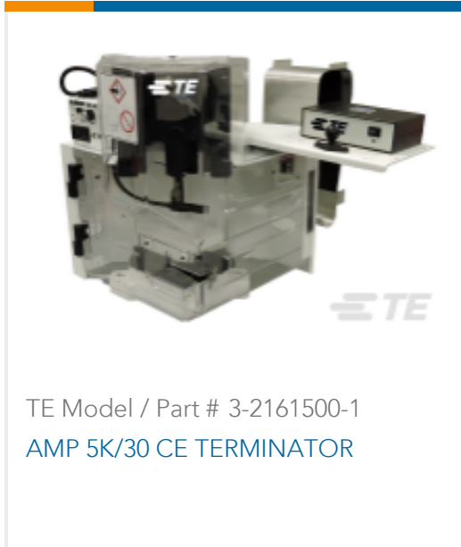
TE Model / Part # 3-2161500-1 AMP 5K/30 CE TERMINATOR