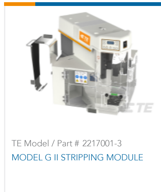
TE Model / Part # 2217001-3 MODEL G II STRIPPING MODULE