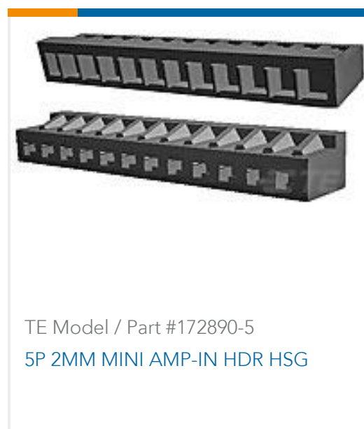
TE Model / Part #172890-5 5P 2MM MINI AMP-IN HDR HSG