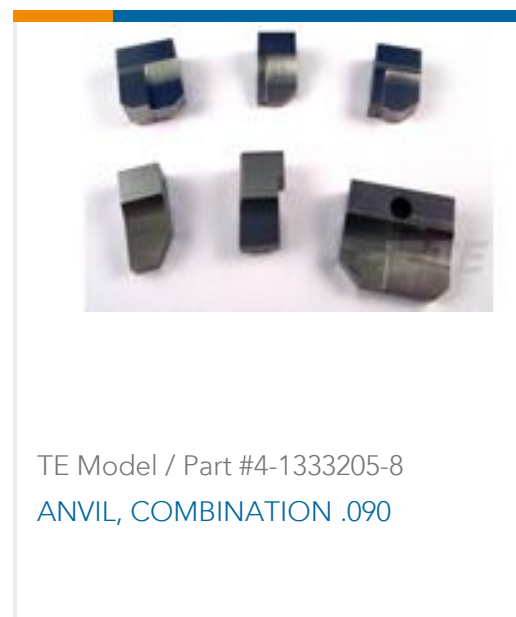
TE Model / Part #4-1333205-8 ANVIL, COMBINATION .090