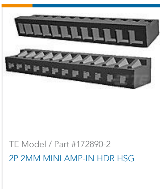
TE Model / Part #172890-2 2P 2MM MINI AMP-IN HDR HSG