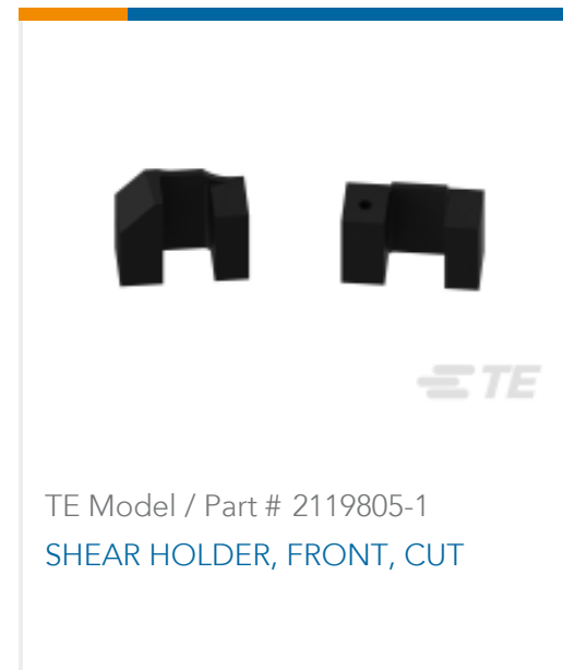
TE Model / Part # 2119805-1 SHEAR HOLDER, FRONT, CUT