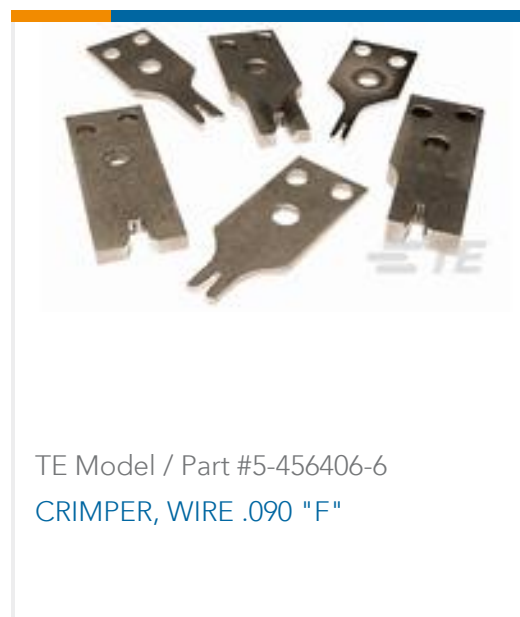
TE Model / Part #5-456406-6 CRIMPER, WIRE .090 "F"