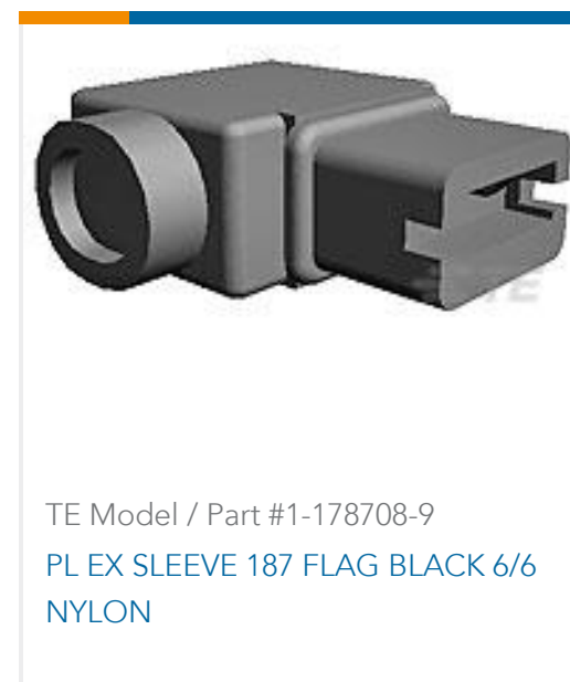
TE Model / Part #1-178708-9 PL EX SLEEVE 187 FLAG BLACK 6/6 NYLON