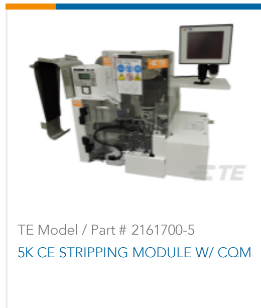
TE Model / Part # 2161700-5 SK CE STRIPPING MODULE W/ CQM