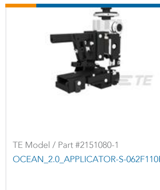
TE Model / Part #2151080-1 OCEAN_2.0_APPLICATION-S-062F110F