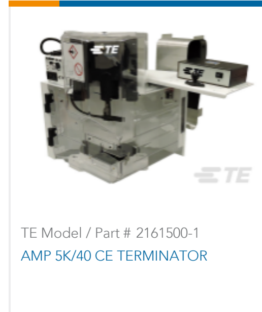
TE Model / Part # 2161500-1 AMP 5K/40 CE TERMINATOR