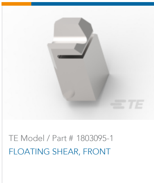
TE Model / Part # 1803095-1 FLOATING SHEAR, FRONT