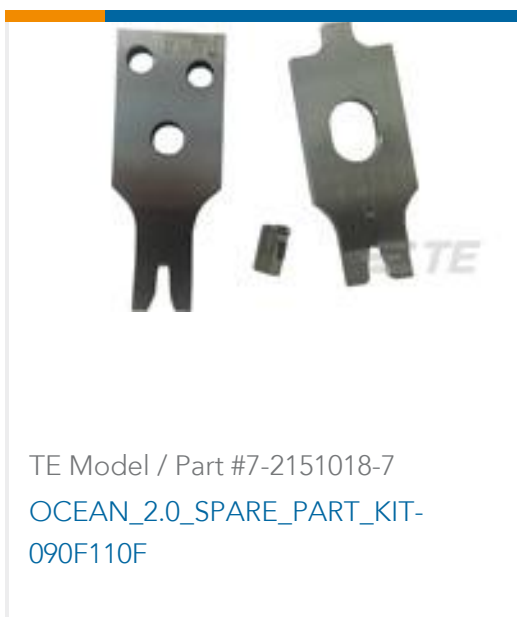
TE Model / Part #7-2151018-7 OCEAN_2.0_SPARE_PART_KIT-090F110F