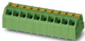
The figure shows 10-pos. standard item (without EX marking)

PCB terminal block, nominal current: 16 A, nominal cross section: 1.5 mm 2 , pitch: 3.5 mm, number of positions: 10, connection method: Push-in spring connection, mounting: Wave soldering, conductor/PCB connection direction: 45 °, color: green, Pin layout: Linear pinning, Solder pin [P]: 2.6 mm