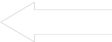
Small Arrow Sticker, White