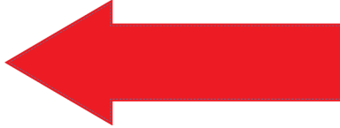
Small Arrow Sticker, Red