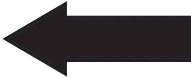
Large Arrow Sticker, Black