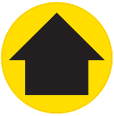
Large Arrow Sticker, Yellow