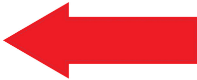
Large Arrow Sticker, Red