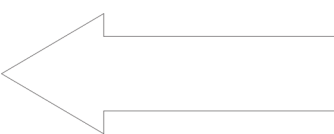
Small Arrow Sticker, White