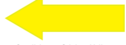
Small Arrow Sticker, Yellow