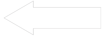
Medium Arrow Sticker, White