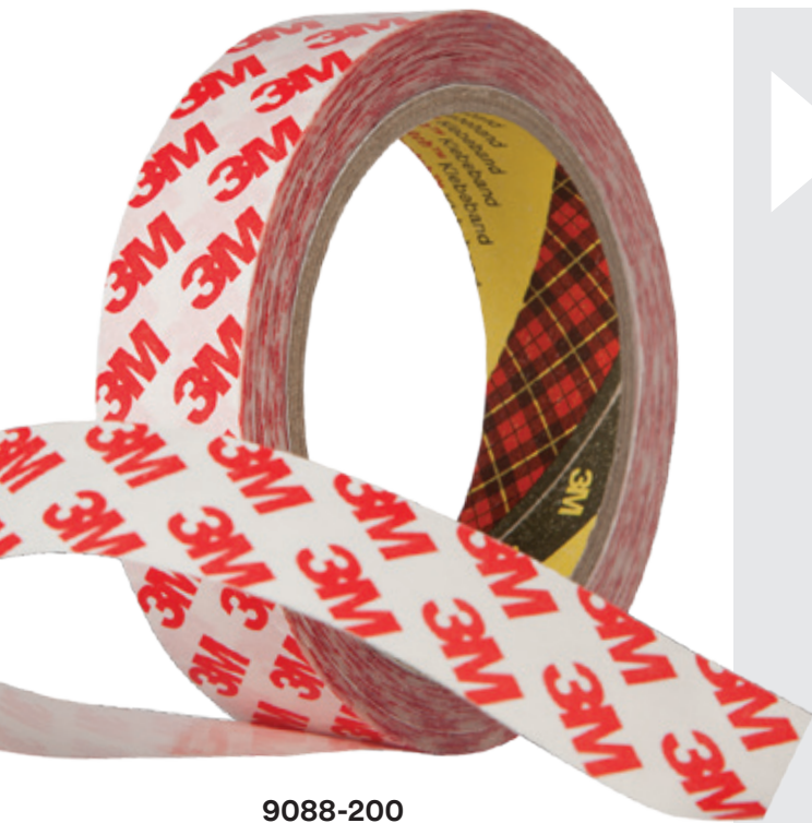
9088-200 Paper liner