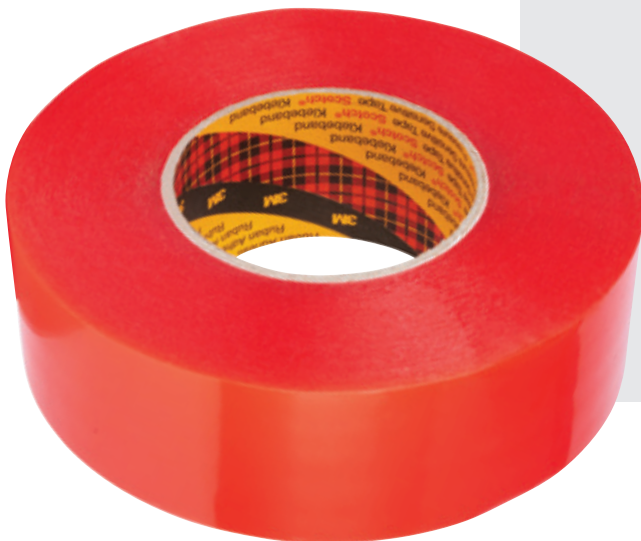
9088F200 Film liner

Value-priced, durable, general purpose tapes have a wide service temperature range from -10°F (-23°C) to 300°F (148°C) as well as: