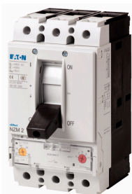
Circuit-breaker, 3p, 25A