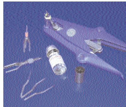
Photo shows the complete DKit. Blue tool body is the same for TYPES, TYPESS and TYPEK.