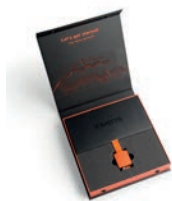
MTi 100-series Development Kit: MTi, software and cabling

All above specifications based on typical application scenarios