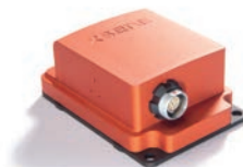
MTi encased: 57x42x23.5 mm, 52g, 9-pins push-pull connector