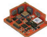
MTi OEM: 37x33x12 mm, 11g, 16-pins header